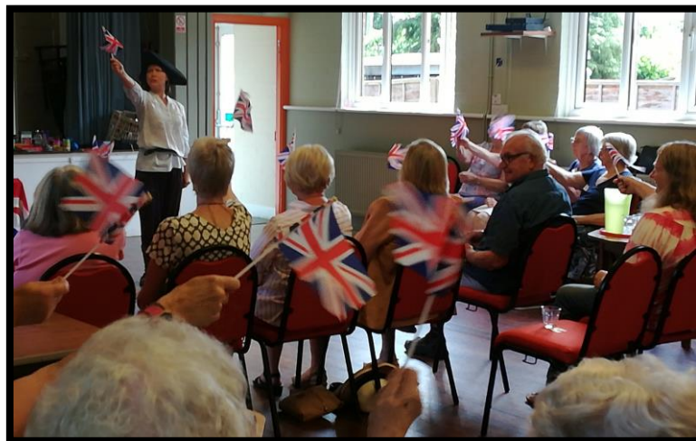
Tor Theatre at 3Ms, Lyneham